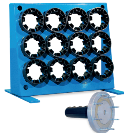
Tool base and Tool rack with QuickChange-tool as an option.