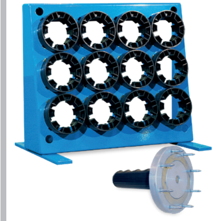
Tool base and Tool rack with QuickChange-tool as an option.